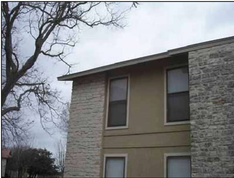
REAR VIEW OF SUBJECT PROPERTY