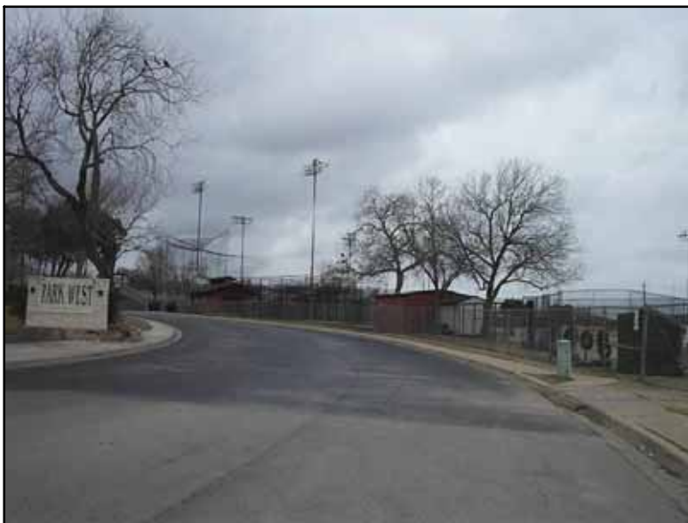
STREET SCENE OF SUBJECT PROPERTY